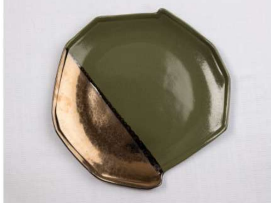
Fab Bottle Medium , £110

For Jess' online interiors shop or to get in touch about making fresh changes to your interiors at home, Go To: latimerliving.com