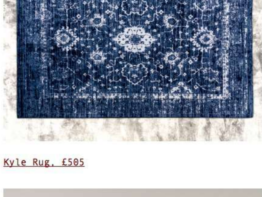
Kyle Rug , £505