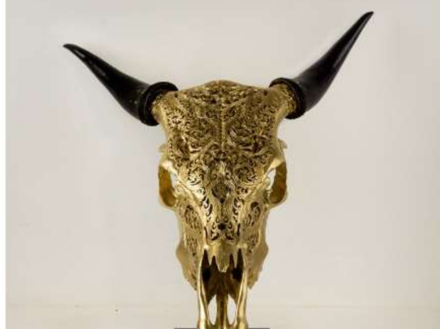
Gold Decorative Impala Skull , £510