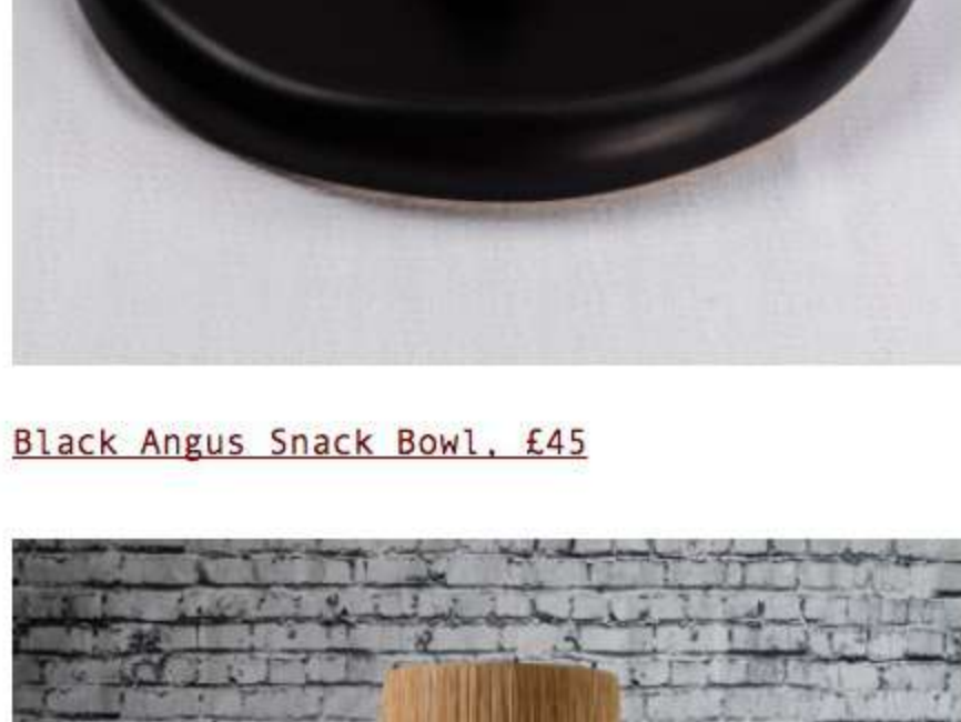
Palm Floor Lamp With Shade , £460