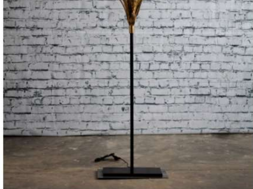
Geometric Ombre Platter , £62