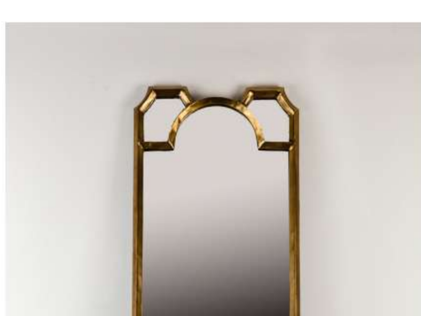
Gilt Esq Mirror , £445