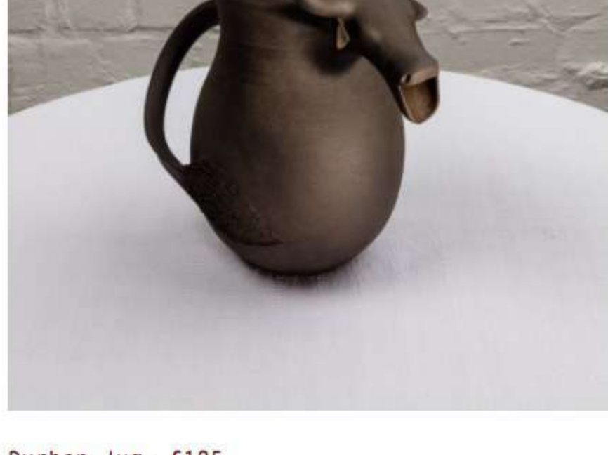
Durban Jug , £185