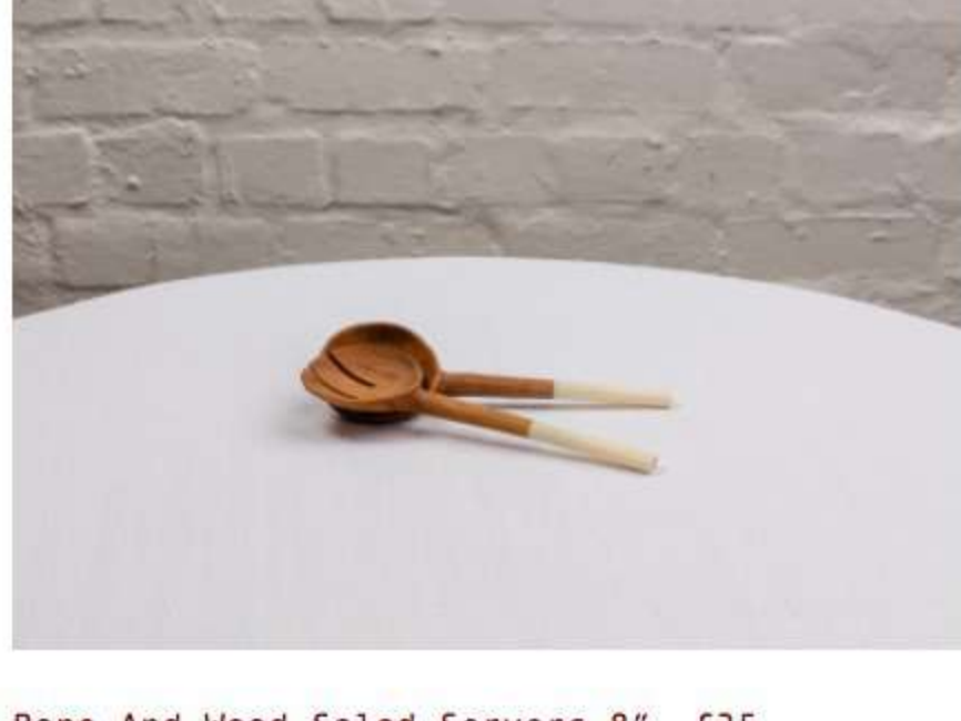
Bone And Wood Salad Servers 8" , £25