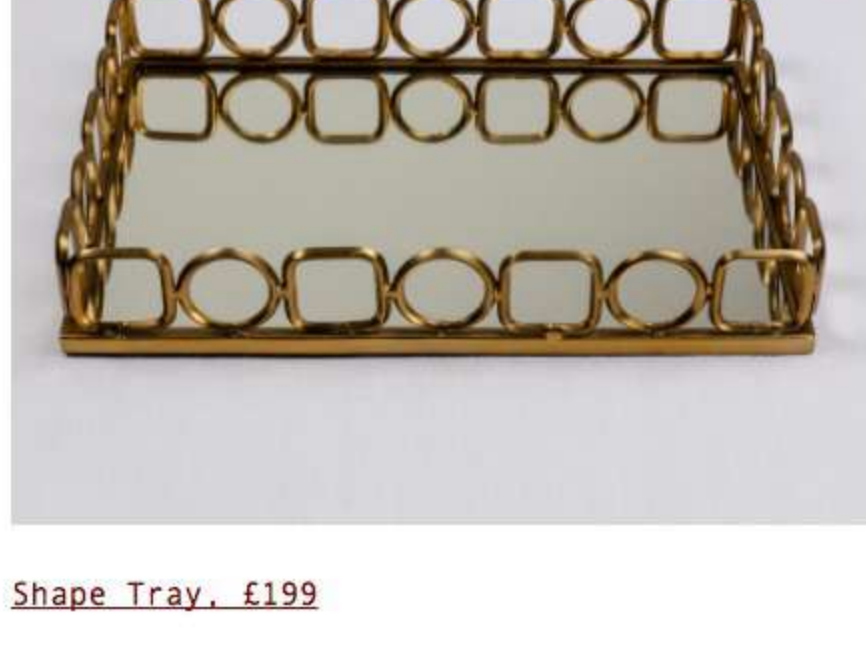
Shape Tray , £199