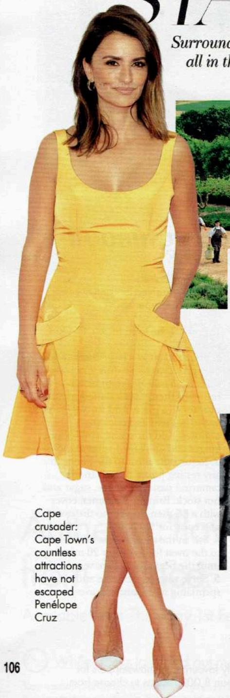
Cape crusader: Cape Town's countless attractions have not escaped Penélope Cruz

Holland sandals , £26, Topshop; visit topshop.com